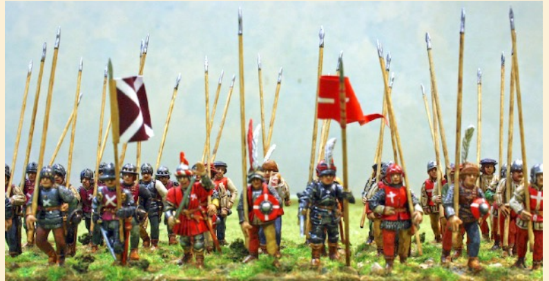
Tudor's French and Scots pikemen

All numbers below are Tree of Battles bases of 5-7 foot or 2-3 mounted